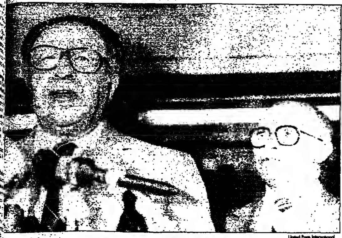
U.S. envoy Philip C. Habib announced in Jerusalem the agreement to cease hostilities between Israeli and Lebanese territory. Israeli Prime Minister Menachem Begin is behind Mr. Habib.